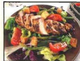
Jerk Chicken Salad

All meals served with White Rice, Rice & Peas, Salad or Steamed Vegetables & Plantains