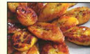
Enjoy a Side of Fried Plantains