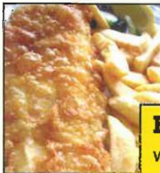
Fried Whiting with Fries ..$10.00